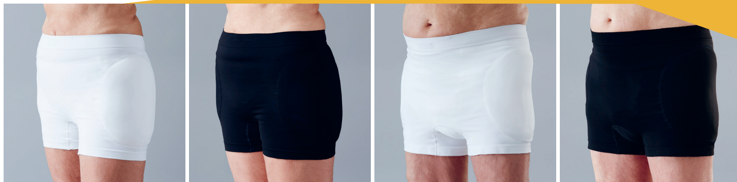
SAFEHIP ® AIRX DISCREET FEMALE WHITE